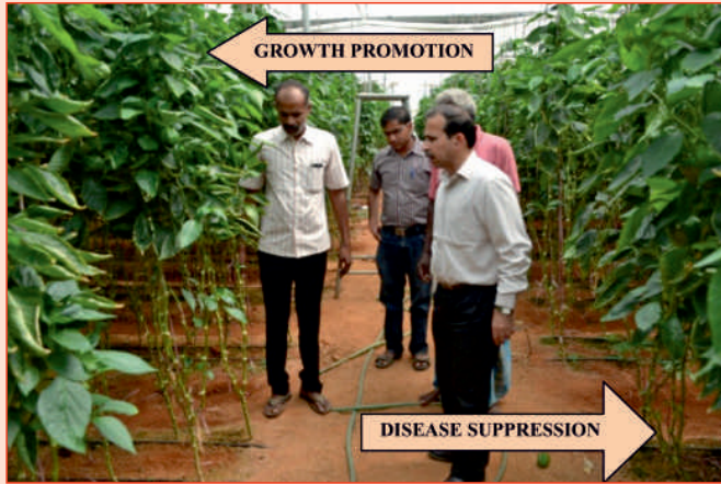
Success story of bioagent formulations