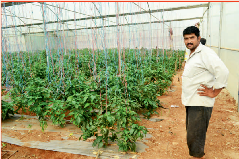
Revival of capsicum plants after application of the formulation of bio-agents

Nematologists at IIHR, Bengaluru standardized successful management strategies of nematodes and other disease complex using bio-pesticides like Paecilomyces lilacinus , Pochonia chlamydosporia , Trichoderma harzianum , T. viride and Pseudomonas fluorescens . Farmers who adopted IIHR technology reduced the use of agro-chemicals to 40 to 45% and obtained 30 to 35% increased yields in capsicum, gerbera and carnations.